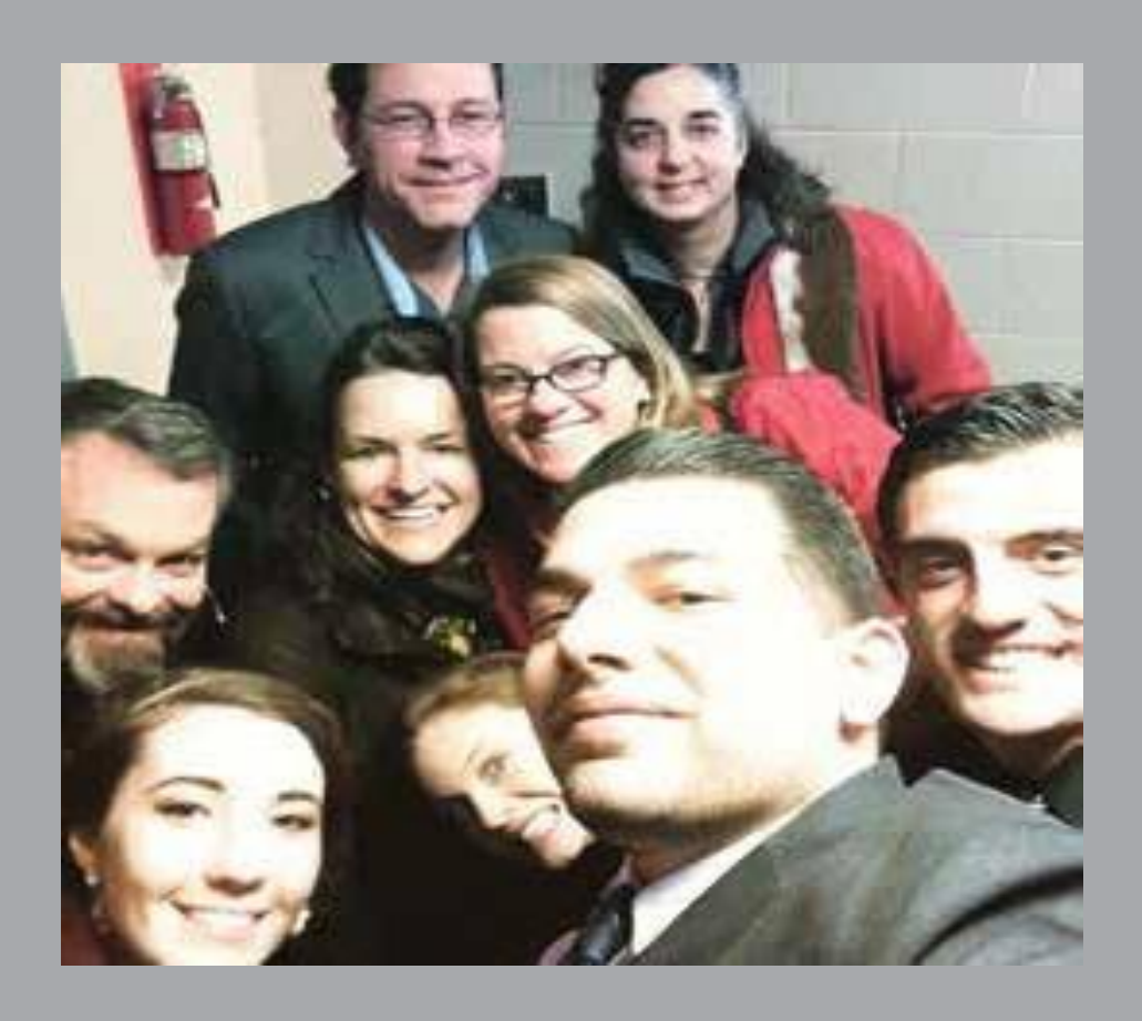
Here's a photo of some of the students and Council members taken at our meeting on Friday night.

We had five amazing students who are all seniors at SA join us for dinner on Friday evening, and they were honest and open with us about "how things are at St. Andrews these days." All five articulately emphasized the value of the education they are receiving here, as well as their appreciation of the faculty.